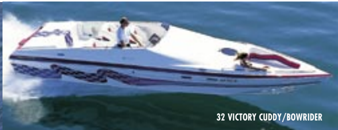
32 VICTORY CUDDY/BOWRIDER