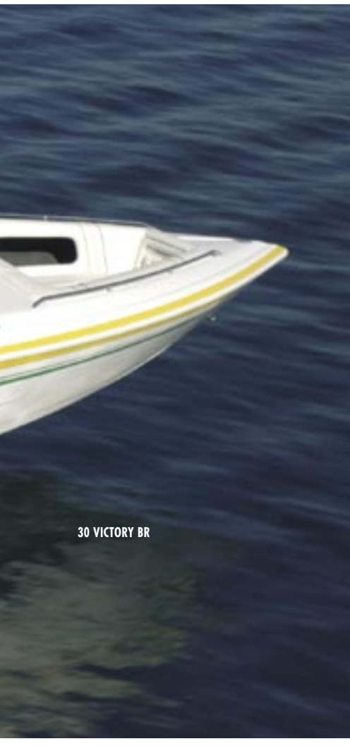
30 VICTORY BR